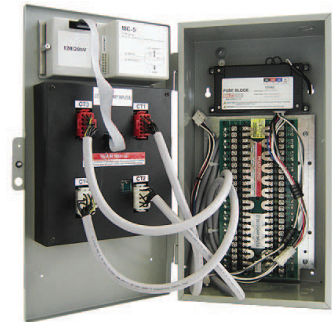
Trilliant® MiniCloset-5c Commercial, Opened