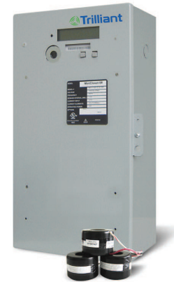
Trilliant® MiniCloset-5c Commercial, Front View

For typical 3-phase 4-wire commercial installations, the MiniCloset-5c requires 3 CTs per meter point (2 CTs per meter point for Delta configured MC-5c's). The MC-5c can monitor up to a total of 8 commercial meter points using 24 CTs (8 meter points x 3 CTs per point). Each CT will connect to the MiniCloset Interface Board (MCI) which is in the enclosure. Installations will vary based on the configuration of the meter.