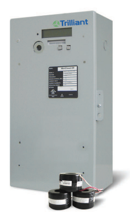
Trilliant® MiniCloset-5c Residential, Front View