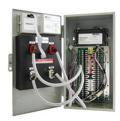
Trilliant® MiniCloset-5c Residential, Opened